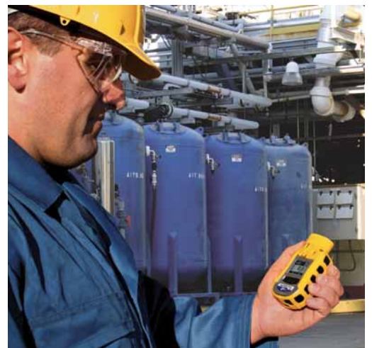
Worker exposure monitoring with ToxiRAE Pro PID at a PVC plant