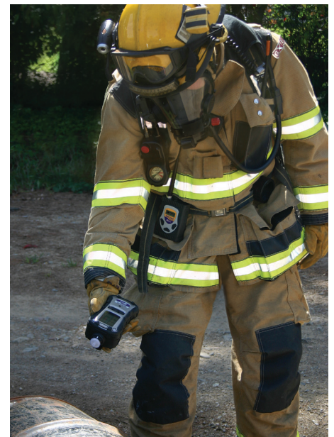
MultiRAE Pro with RAELink3 Mesh used for screening potentially hazardous drums