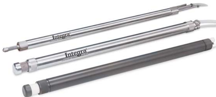
Integra Bladder Pumps available in Stainless Steel 1" and 1.66" (25 mm and 42 mm) or PVC 1.66" (42 mm)

The 1.66" dia. (42 mm) by 2 ft (0.6 m) Stainless Steel Integra Bladder Pump (42 x 610 mm) utilizes most of the same parts as the pneumatic drive Solinst 1.66" Double Valve Pump (DVP). The DVP can operate from greater depths and provide higher flow rates. Conversion from an Integra Bladder Pump to a DVP and back again is quick and easy (approx. 2 min.) and requires no tools.