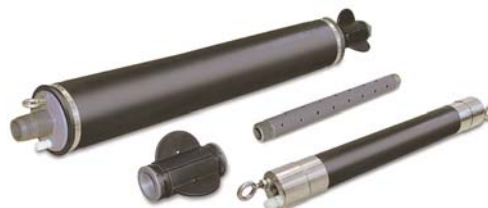
Model 800 Packers 3.7" and 1.8" (94 mm and 46 mm)

Model 800 Low-Pressure Packers can be used with Integra Pumps to minimize purge times by reducing purge volumes. This reduces the cost of water disposal and labour. Packers are available in single point or straddle packer designs, and in sizes to fit 2" (50 mm) to 5" (127 mm) dia. wells. (See Model 800 Data Sheet.)