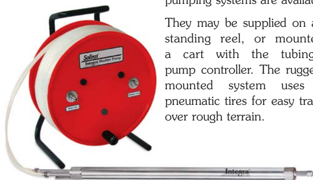
Bladder Pump Stainless Steel 1" (25 mm) on Free-standing Reel

For less frequent sampling, and to allow access to multiple monitoring wells, even in remote locations, portable Integra pumping systems are available.