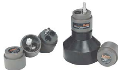
Dedicated Well Caps 2" and 4" (50 mm and 100 mm)

The caps slip easily onto 2" dia. (50 mm) wells. Adaptors to fit 4" dia. (100 mm) or other well sizes are also available. The cap seals in place with an o-ring, and comes with a wire connected protective cover. Low profile wellheads are also available for flush mount casing applications.