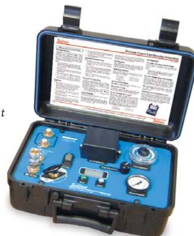
Electronic Control Unit Model 466

The pump is quick to disassemble and the bladders and screens are simple to replace in the field. No tools required. Inexpensive polyethylene bladders can be quickly replaced to suit regulatory requirements.