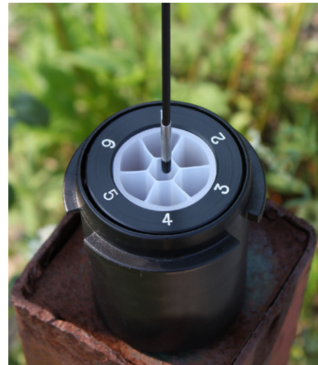
Measure Water Levels within the narrow channels of a Solinst CMT® System.

The 102M Mini Water Level Meter is available in 80 ft. and 25 m lengths. There is the choice of the P4 or P10 Probe.