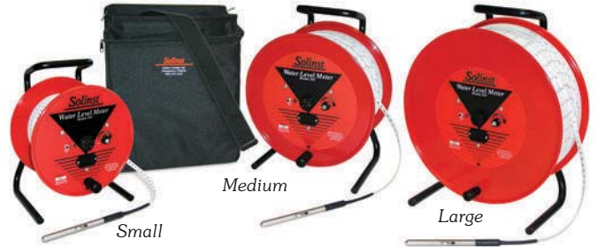
Model 101 Water Level Meter Reels

* Polyethylene tapes are only available in these lengths